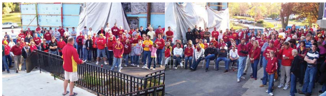
Our alumni, family, and friends are back at 201 Gray for our annual alumni gathering. We packed the yard!