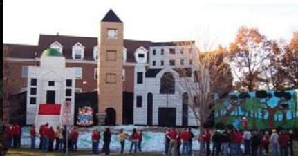
Lawn Display—1st place winner