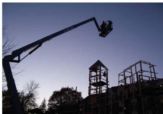
We rented an independent lift