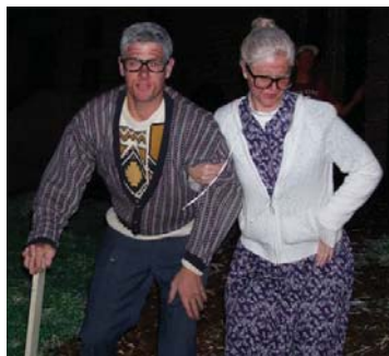
Alumni characters in skit