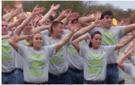
Yell like Hell—1st cuts