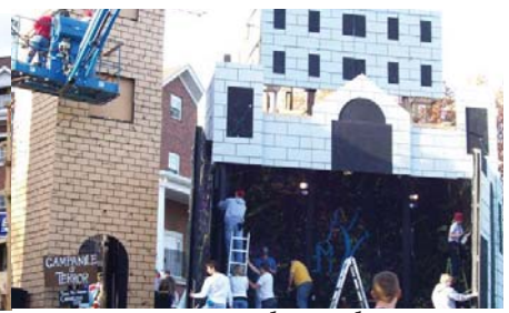
Progress in the making