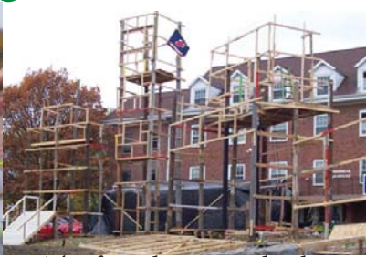
The foundation to display