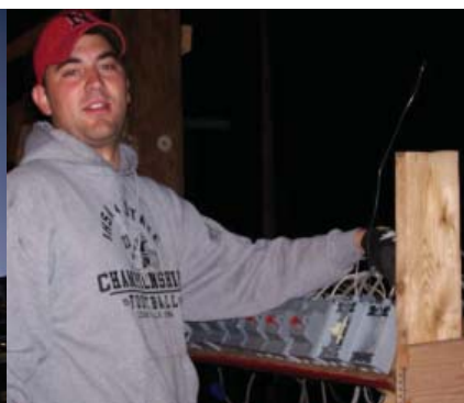
It takes many electrical boxes