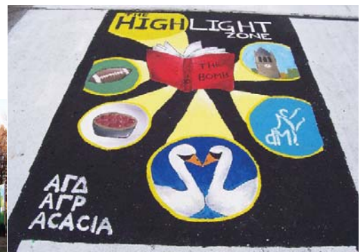
Victory Lane—1st place winner